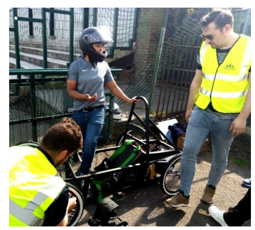
Figure 1- Teen preparing to race a car she had built with her peers

• Events – We supported a range of local events this year, including our own 'Youth Sports and Activities Day' in June.