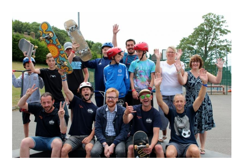
Figure 3 - Members of the intergen steering group with Council skate workers and their MP