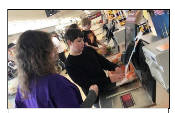
Members of the Youth Club, J and R, making healthy food choices and handling money at the supermarket.

How have the services in your area, over this period, enabled young people with Protected Characteristics e.g. BAME, disabled or LGBT or with multiple disadvantages e.g. facing school exclusion, experiencing mental health issues and/or poverty to feel safer and supported?