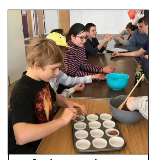
Cookery sessions at Extratime help young people with SEND to build valuable healthy lifestyles, kitchen skills and interpersonal skills

How have the services in your area, over this period, supported communities with council house tenancies, particularly around, anti-social behaviour, social inclusion and improving readiness for employment?