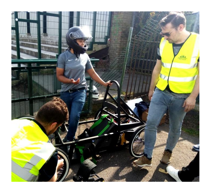
Figure 4 - Teen preparing to test drive the kit car she and others had built

REBOOT Youth Coaches – The TDC is part of a partnership that has brought £165k to the city to engage and coach young people who are on criminal trajectories. This is as a response to needs presented by the community and the Police.