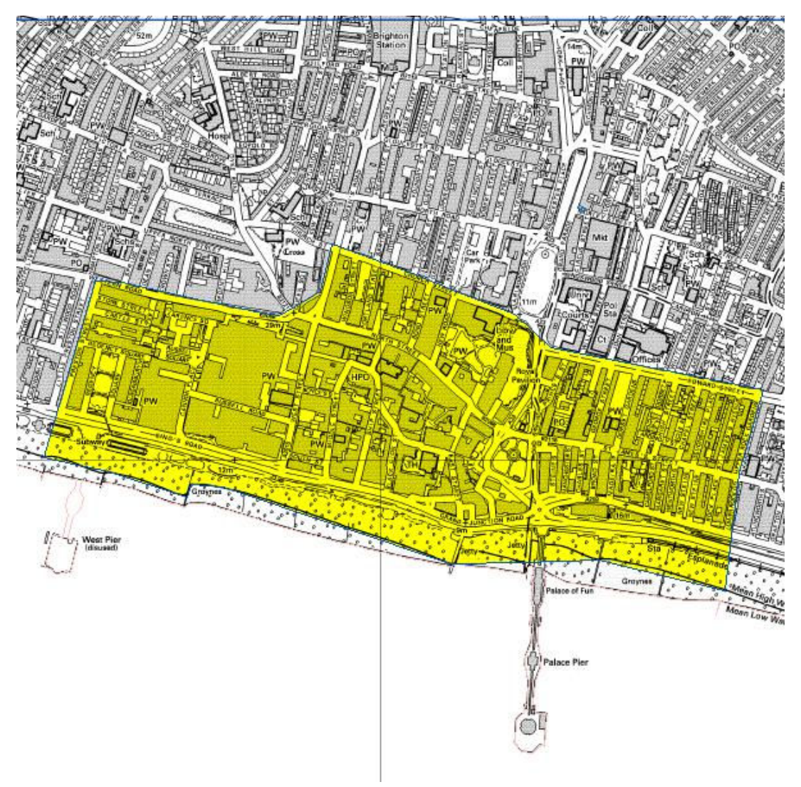
Brighton & Hove City Council - Cumulative Impact Area

The Cumulative Impact Area comprises the area bounded by and including: the north side of Western Road, Brighton from its intersection with the west side of Spring Street to the junction with the west side of Dyke Road at its eastern end; from there, north-east to the junction of the north side of Ayr Street with the west side of Queens Road and then northward to the north-west corner of Queens Road junction with Church Street; thence along the north side of Church Street eastwards to its junction with Marlborough Place and continuing south-east across to the north-western junction of Edward Street; along the north side of Edward Street to the east side of its junction with Egremont Place and southward along the eastern sides of Upper Rock Gardens and Rock Gardens; southward to the mean water mark and following the mean water line westward to a point due south of the west boundary of Preston Street; northward to that point and along the west side of Preston Street to its northwest boundary and then diagonally across Western Road to its intersection with the west side of Spring Street